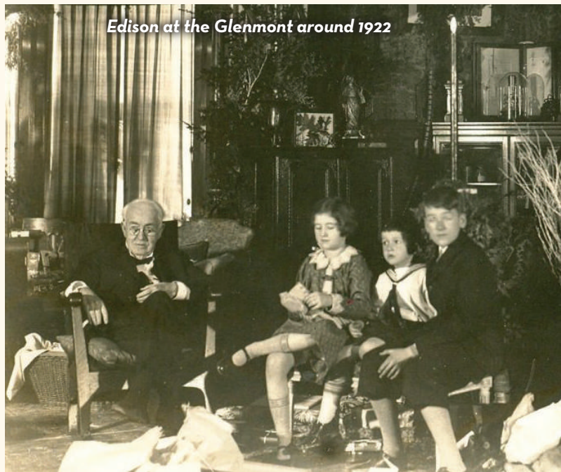
Edison at the Glenmont around 1922

to $321 dollars in today's monetary conversion. According to the Fort Myers Press, Santa's campaign was a success with several dozen baskets being assembled, packed, and given away to those in need.