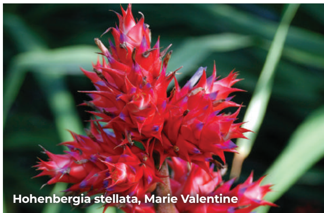
Hohenbergia stellata , Marie Valentine