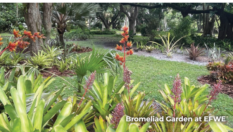
Bromeliad Garden at EFWE

*Indicates plants in the Edison and Ford Winter Estates gardens.