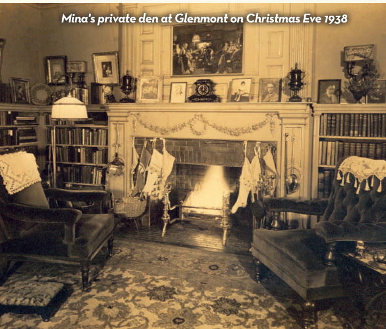
Mina's private den at Glenmont on Christmas Eve 1938