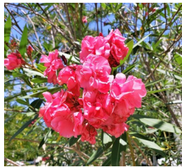
Oleander Nerium oleander