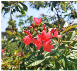
Jatropa Jatropha integerrima