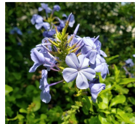
Blue Plumbago Plumbago auriculata