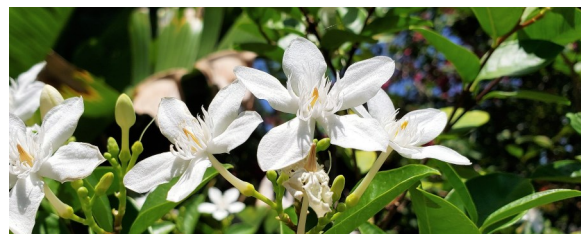
Asian Snow Wrightia antidysenterica

There's tropical milkweed ( Asclepias curassavica ) blooming outside the Edison Caretaker's House, but these caterpillars prefer to eat the dill planted next to it.