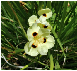
African Iris Dietes bicolor