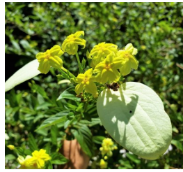
Dwarf Mussaenda Pseudomussaenda flava