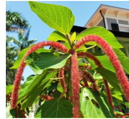
Chenille Plant Acalypha hispida