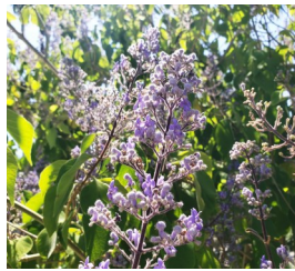
Tropical Lilac Cornutia grandiflora