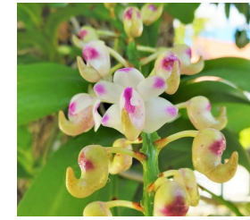
Orchid Orchid spp.