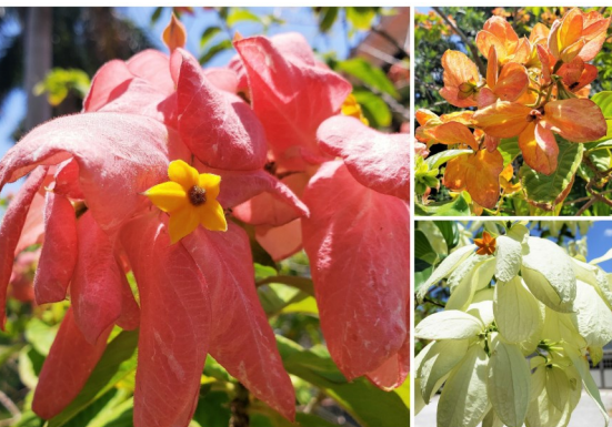
Tropical Dogwood Mussaenda spp.