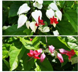
Bleeding heart Vine Clerodendrum thomsoniae