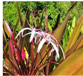
Crinum Lily Crinum augustum