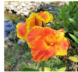
Canna Lily Canna spp.