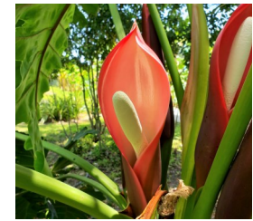
Philodendron Philodendron spp.