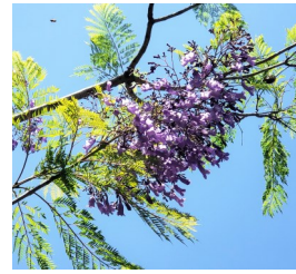
Jacaranda Jacaranda mimosafolia