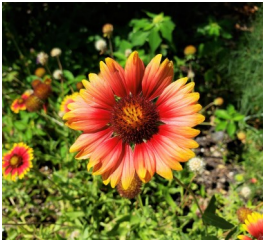
Blanket Flower Gaillardia pulchella