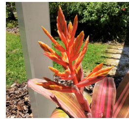
Bromeliad Bromeliad spp.