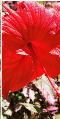
Hibiscus Hibiscus spp.