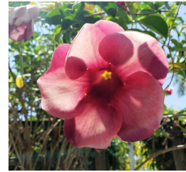
Pink Allamanda A. cathartica 'Cherries Jubilee'