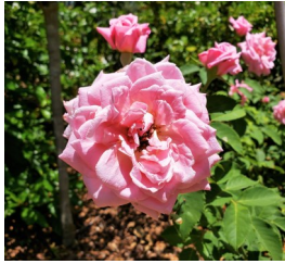
Rose 'Belinda's Dream'