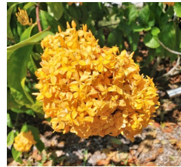
Ixora Ixora coccinea