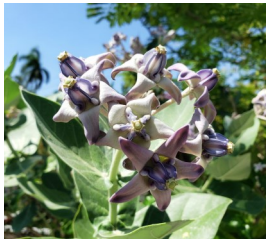
Giant Milkweed Calotropis gigantea