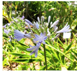
Lily of the Nile Agapanthus sp.