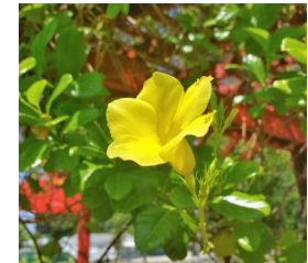
Wild Allamanda Urechites lutea