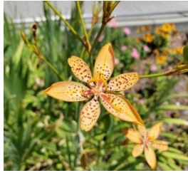
Blackberry lily Iris domestica