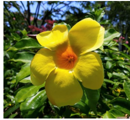
Allamanda Allamanda cathartica