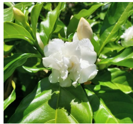
Crape Jasmine Tabernaemontana divaricata