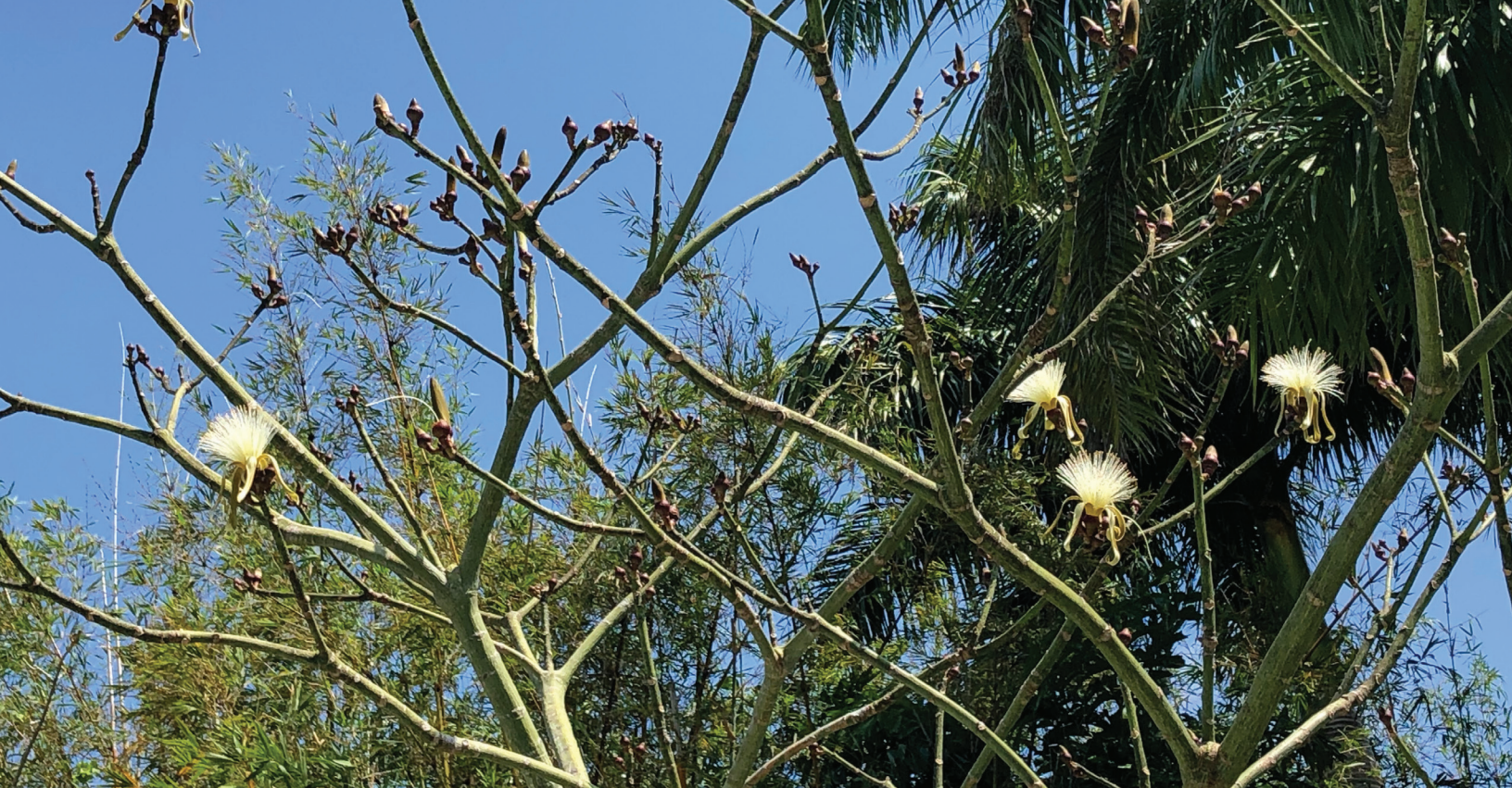
White Shaving Brush Tree ( Pseudobombax ellipticum )