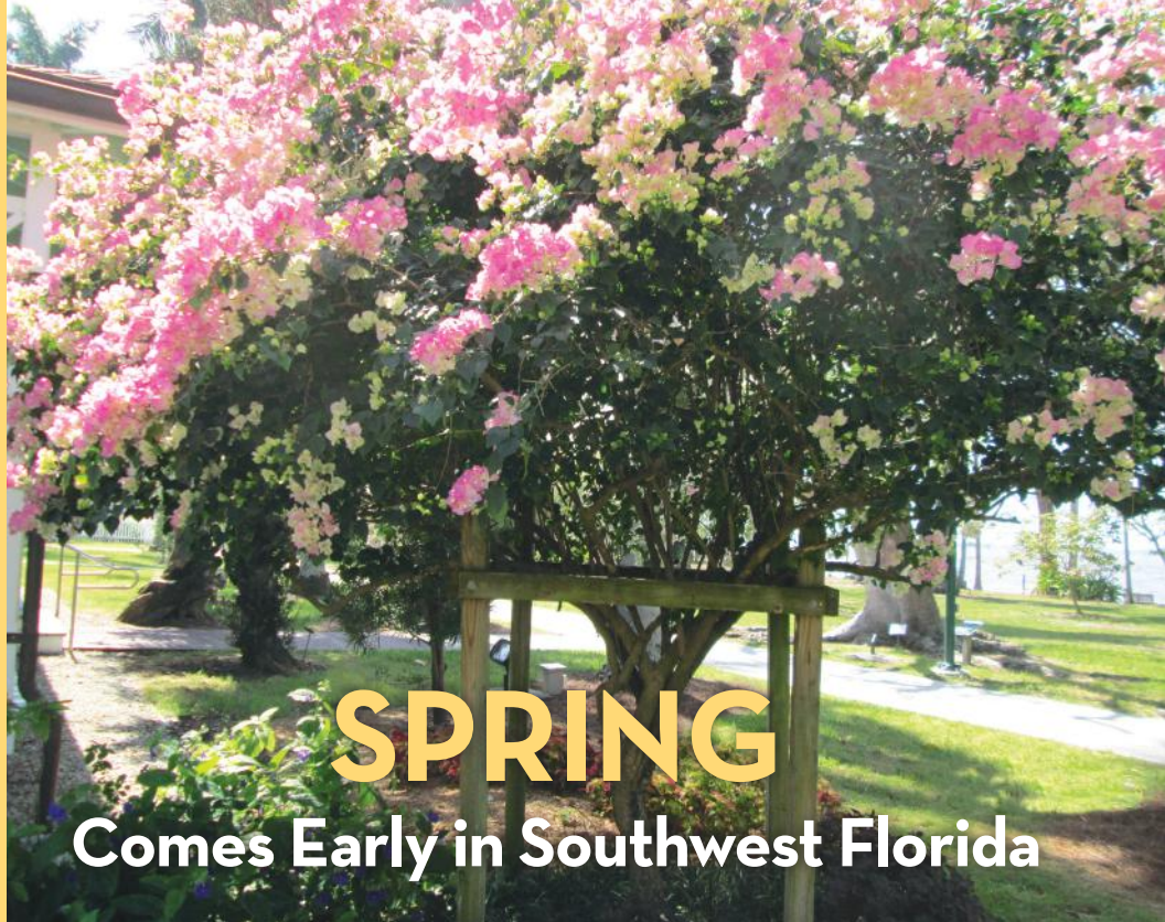
Bougainvillea in bloom

While many northern states are still covered in snow, here in Southwest Florida, spring has sprung! The temperature is once again reaching into the 80s and shrubs, like the Bougainvillea are bursting with beautiful blooms!