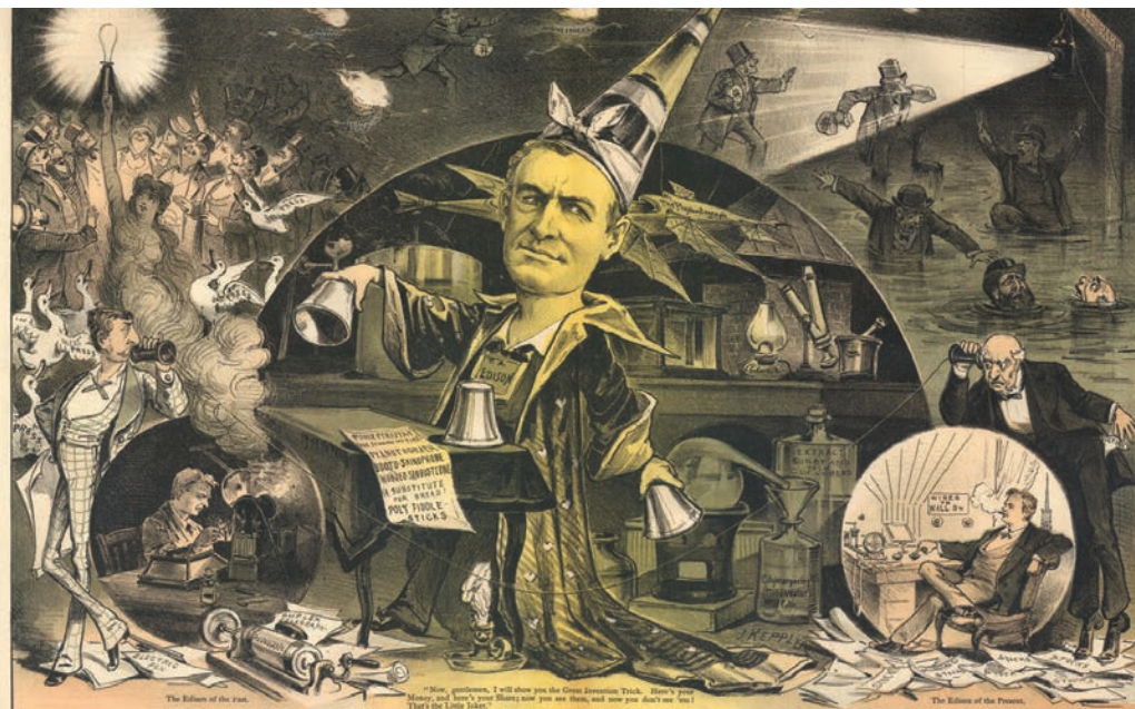
THE DECADENCE OF THE WIZARD OF MENLO PARK.—FROM THE PHONOGRAPH TO POLYFORM.

As always, members get in free. We hope to see you soon!