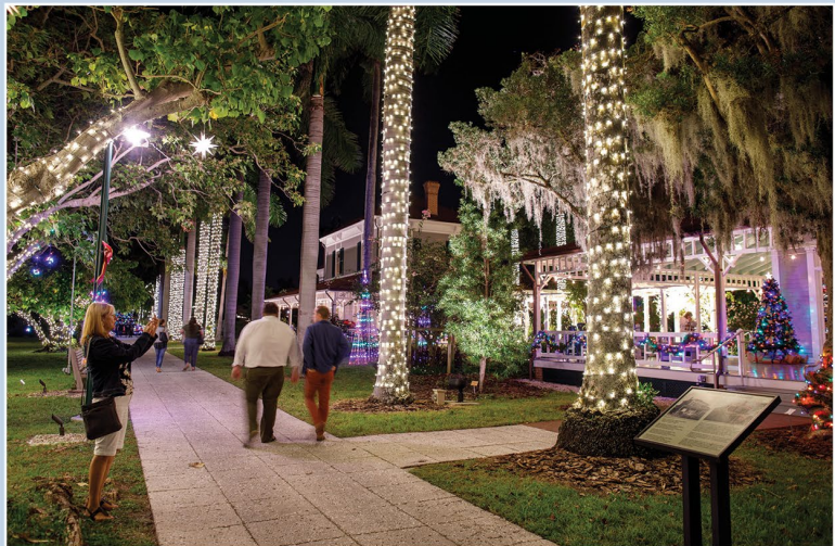
Children's Tree Trail sponsored by:

Favorite traditions from past years will also return on select nights, including live music, special discounts for local residents, and more!